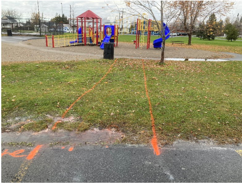
New path constructed at 100 Club Park