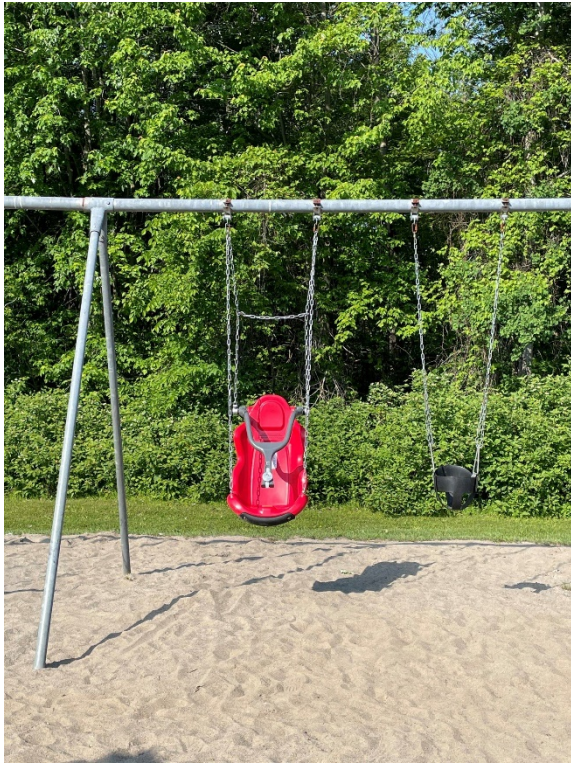
AODA swing – installed at several parks