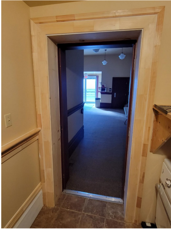
Washroom renovation at Old Town Hall