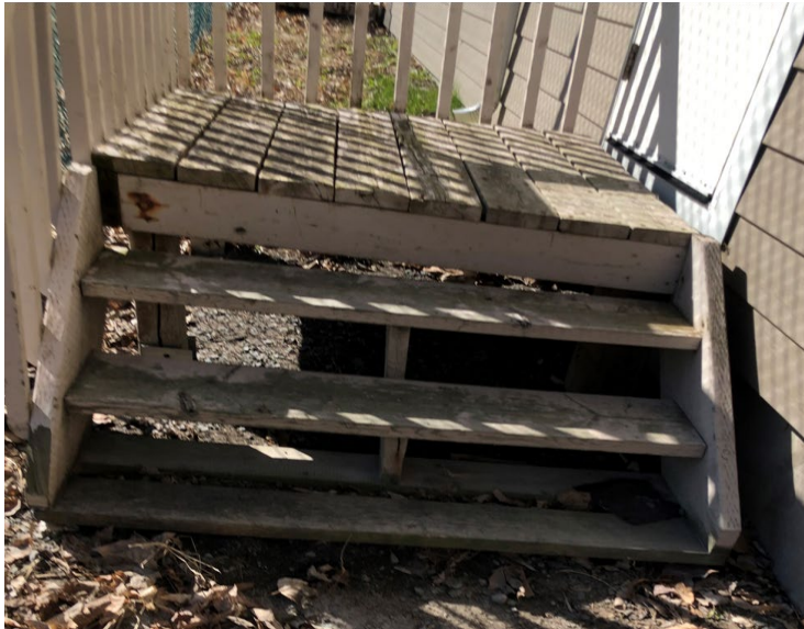
Old stairs at the Nelson LaPrade Center