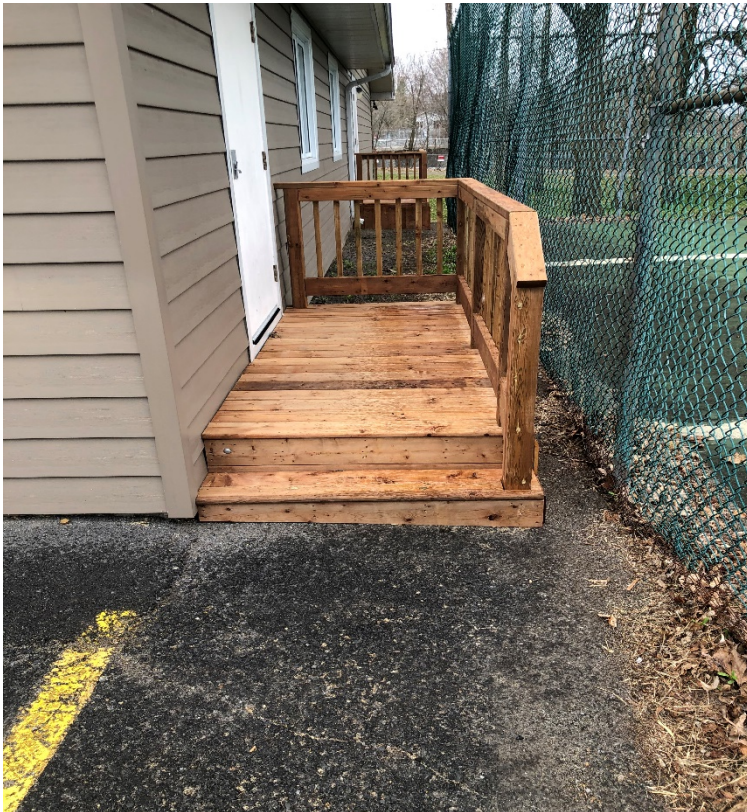
New stairs at the Nelson LaPrade Center