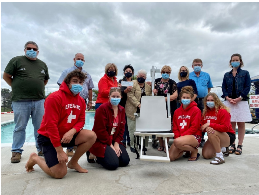
1 AODA pool lift now at each Municipal pool