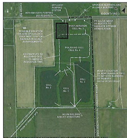
Overview of Preferred Solution