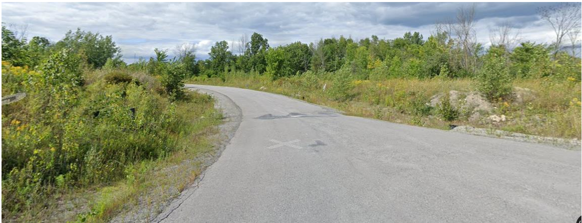
Tudor Gate Place

The son of the original developers of the subdivision has conditionally sold the two security lots held by the Township. He is offering that the Township hold the proceeds from the sale (less legal fees, commissions, transfer taxes, etc.) as cash security rather than lots. The proposed sale is for $160,000 for the two lots and the Township would obtain $150,000 as cash security. With the existing $100,000 being held as security, the Township should be in secure position to complete the outstanding works in the event the developer defaults (a total of $250,000 in cash would be held by the Township).